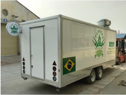
- Door -