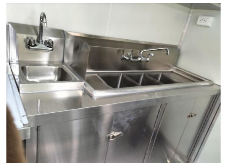
- Sink -