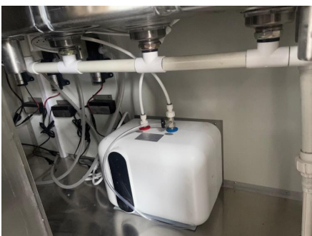
- Water Heater -