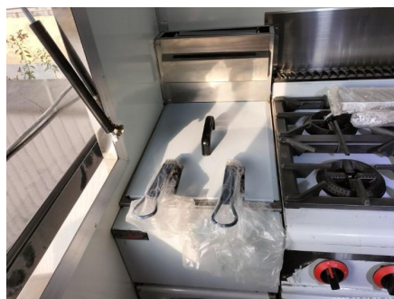
- Deep Fryer -