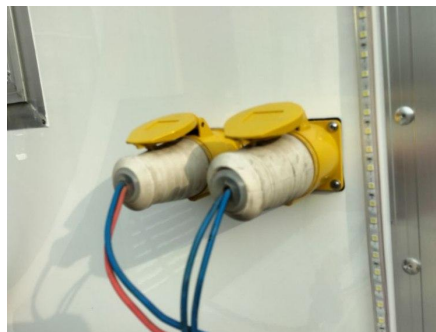
- Generator Receptacles -