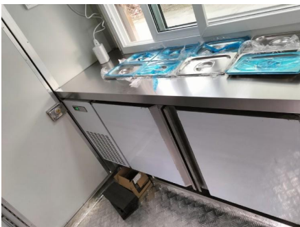
- Fridge -