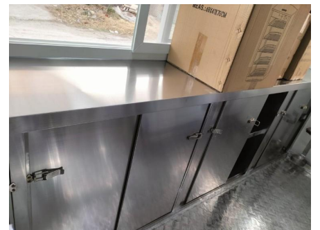
- Workbenches -