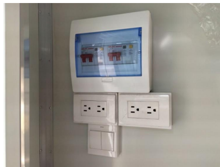
- Electrical System -