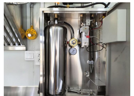
- Fire Suppression System -